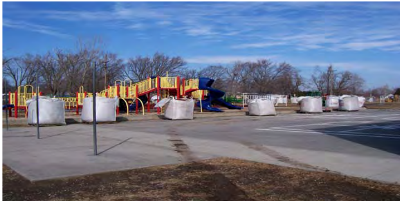
Above: Bags of mulch positioned to be opened.