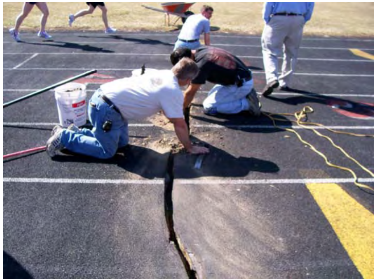
PHOTO: USD 333 Maintenance Staff repairing cracks in the track.

The USD 333 Board of Education has had several special meetings to discuss the ongoing planning process for the district. Many areas have been discussed, and the Board will soon be prioritizing major projects. Currently, the Board has no plans for proposing any Bond Issues, as we currently are paying for the Concordia Elementary School Bond. No major building projects or construction will be proposed until the CES Bond is paid, which will be in 2014. All projects completed by the Board will be funded through the current budget and sources.