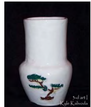
3-d art I Kyle Kalivoda