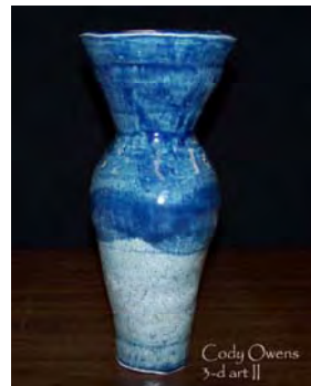
Cody Owens 3-d art II