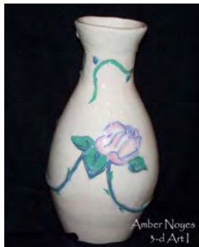
Amber Noyes 3-d Art I